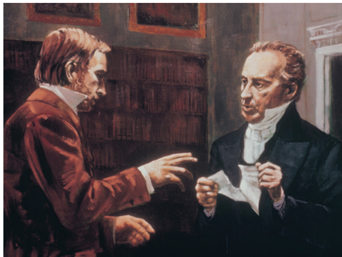
Martin Harris meets with Professor Anthon

In February 1828, Martin Harris, a farmer from Palmyra, New York, visited the Prophet Joseph Smith, who was then residing in Harmony, Pennsylvania, where he had just begun to translate the Book of Mormon (see Book of Mormon Translation By Joseph Smith). Smith had earlier turned to Harris for financial backing for the